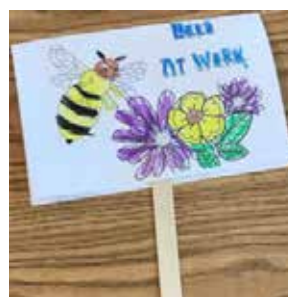
A student's art