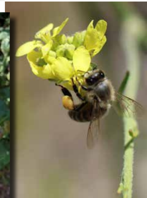
Wild mustard – yes it is still blooming