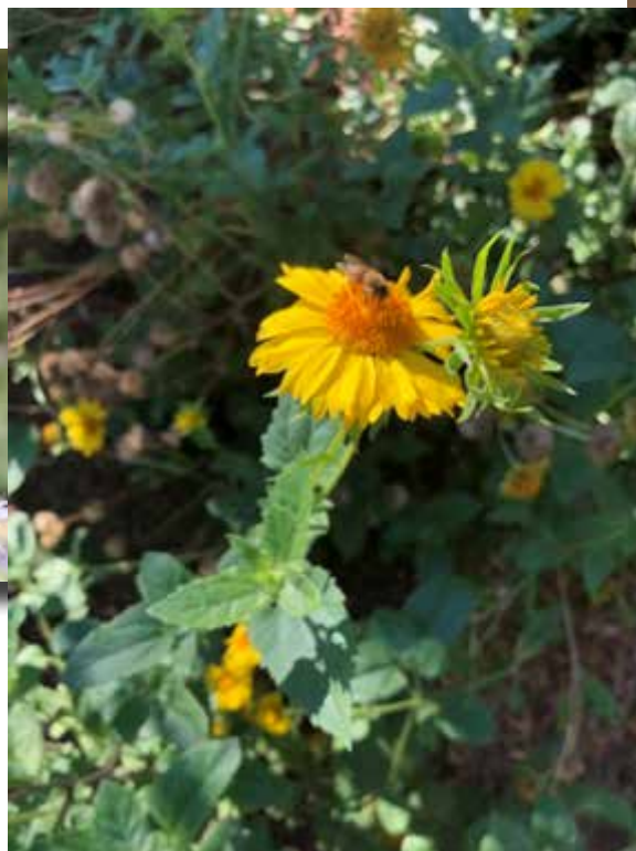
Cowpen by Ann Gallagher White