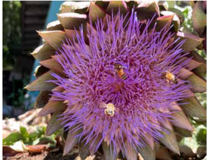
Bees are loving Shannon Carr's artichokes!