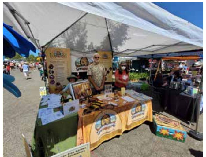
In July SCBA members helped spread the word about pollinators and the need for careful pesticide use at the Petaluma Art and Garden Festival.