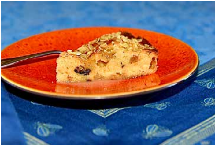
Apple Miso Honey Cake.

You can serve the sauce warm, or just set it aside until you are ready and carefully rewarm it before serving. But do not put it in the fridge as it may get too firm.