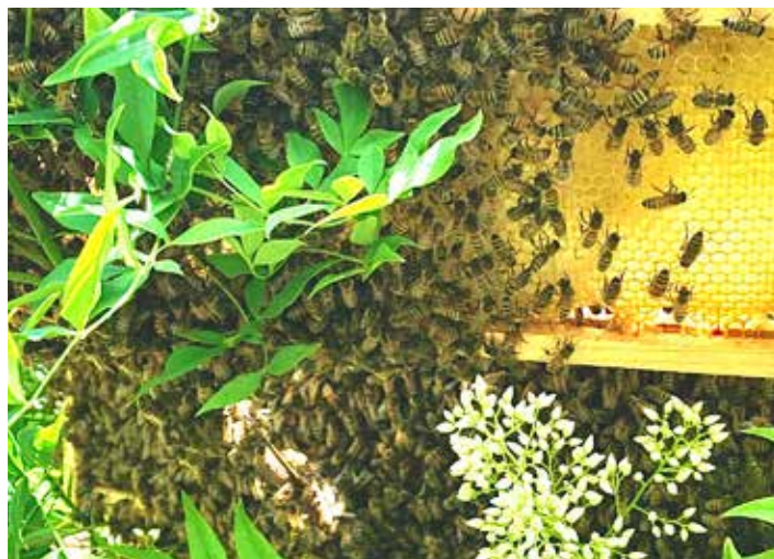
Swarm on nandina bush

My bees have got me again. I had two hives swarm on two separate days just as I was setting up to go into them and look for queen cells. I literally had my bucket, jacket and gloves out when they went. Of course, they were huge swarms and, of course, they went 40 feet up into our neighbors' trees. That I why I always like to share honey with my immediate neigh-