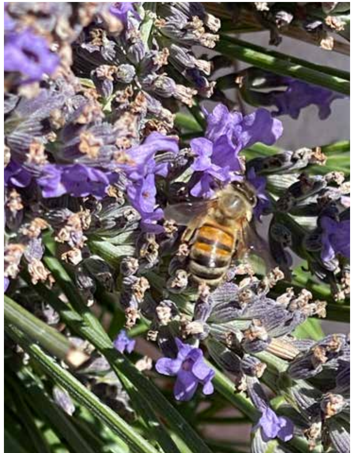
Shannon Carr captured this busy gal on lavender!