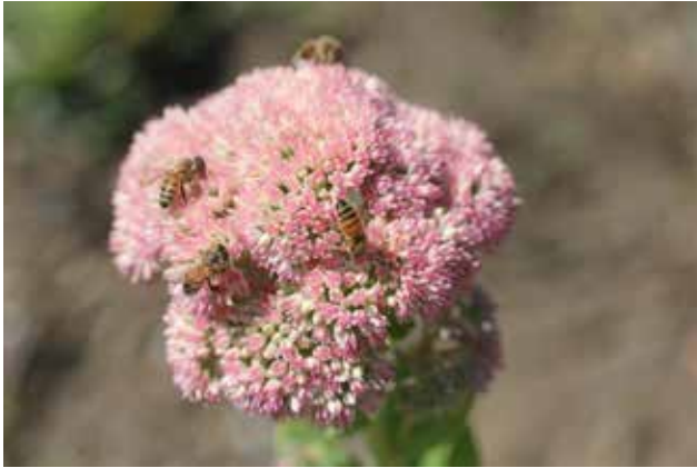
Bees covering the sedum flowers.