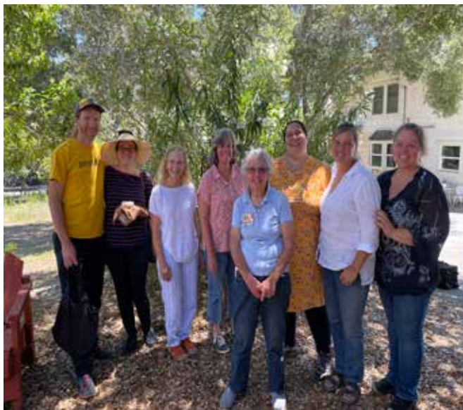
South Cluster's picnic on July 23.