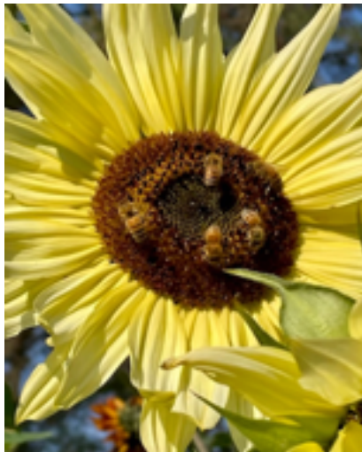
Helianthus annuus 'Valentine' sunflower

Click Here for the Up-to-Date Roster of SCBA Resources