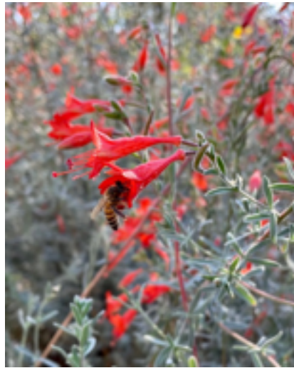
Epilobium canum 'Catalina,' California fuchsia