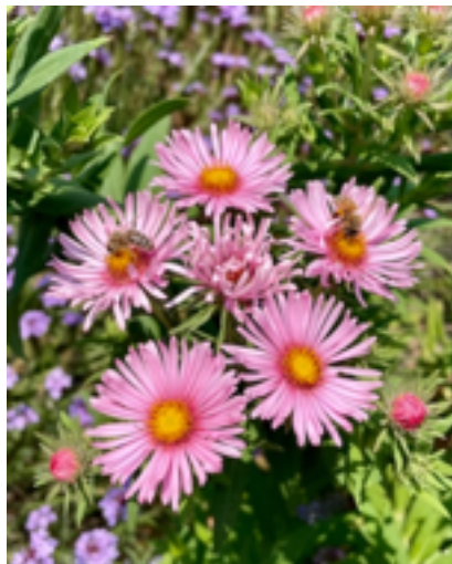
Aster novae-angliae 'Harrington's Pink,' pink New England aster

cleaning up, weeding, and refreshing the Hedgerow we planned and planted with Grange members in 2020. This was a wonderful opportunity for G4B members to re-visit the hedgerow reinforce a partnership between the two groups.