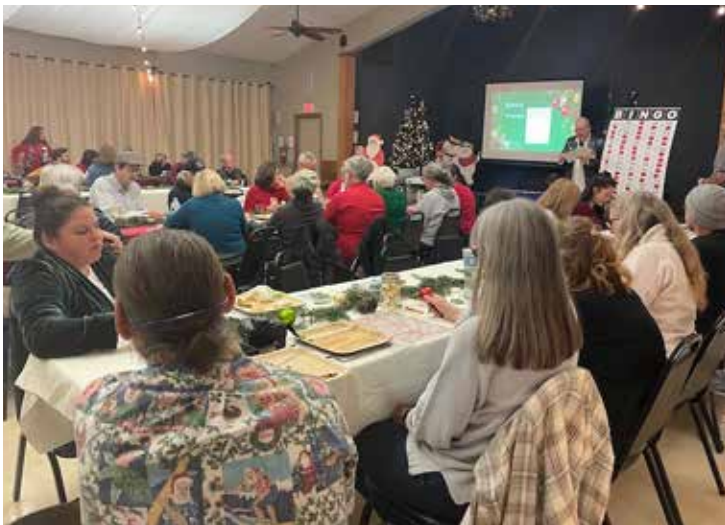
Playing Bingo is a tradition at the SCBA Holiday Party.