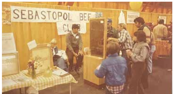
1970s: Sebastopol Bee Club shares beekeeping stores with visitors to its information booth.