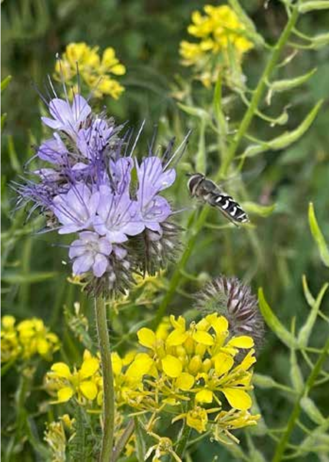
This pollinator is often called a “bee-mimic” as it has evolved to look like and mimic honeybee behavior to gather nectar from flowers!