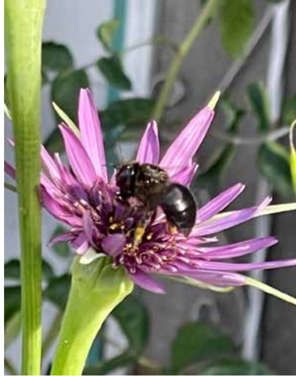
Carpenter bee.