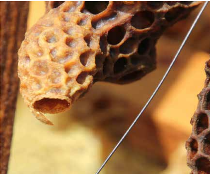
A recently opened queen cell.